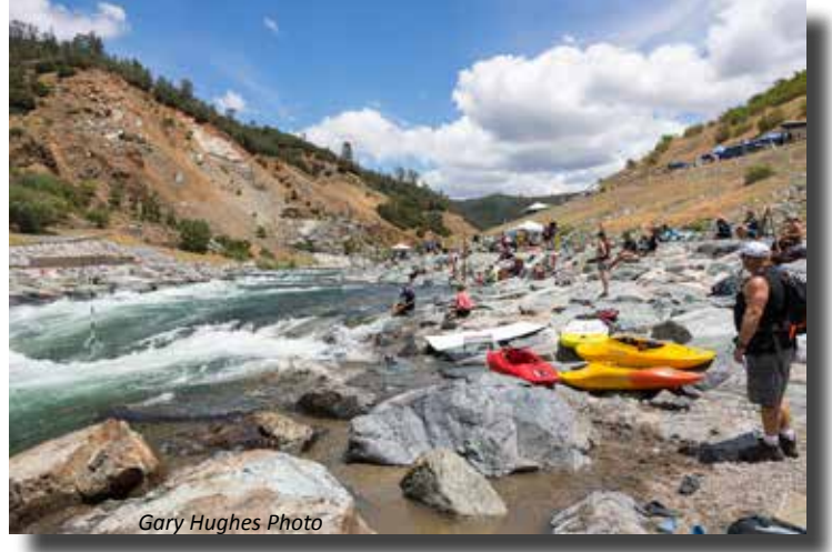
Auburn State Recreation Area and The Pump Station Rapid area was the site of the 2018 Auburn River Festival

Mammoth Bar river access is now open year-round after being closed last season. Please remember that there are sudden increases in the flow of colder water every afternoon due to hydroelectric dam releases upstream, and that there is a risk for swimmers and waders being swept downstream into the very dangerous Class 5 Murderer's Bar rapid. At the Confluence, PARC is working to create a boating put-in site with a convenient loading zone for boat drop-off.