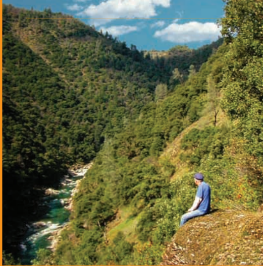
North Fork Gorge below Mineral Bar.