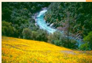
Windy Point Trail Meadow.

The undammed free-flowing North Fork American River from its headwaters in the Sierra Nevada Mountains to Upper Lake Clementine includes accessible deep scenic canyons with a mosaic of diverse, unique foothill plant and wildlife communities. Visitors enjoy fishing, hiking, swimming, whitewater boating, nature study, recreational gold panning and much more.