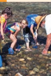
Junior Ranger American River Ecology exploration at Upper Clementine.

Some places are unique and irreplaceable – worthy of protection. California Wild & Scenic designation would help ensure continued funding for the Auburn State Recreation Area while protecting its unique and irreplaceable natural resources.