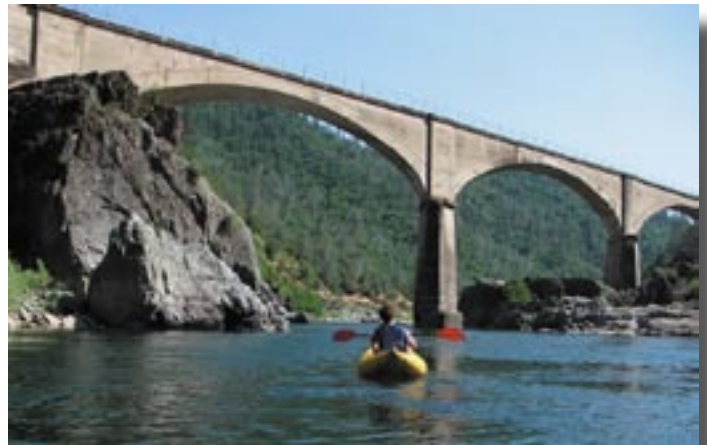
PARC nominates the Confluence to China Bar American River Run for inclusion in our Geotourism Guide. This stretch of river, below Auburn, features many opportunities to experience American River history, ecology and the challenge of the new Pump Station Whitewater Rapids at China Bar.