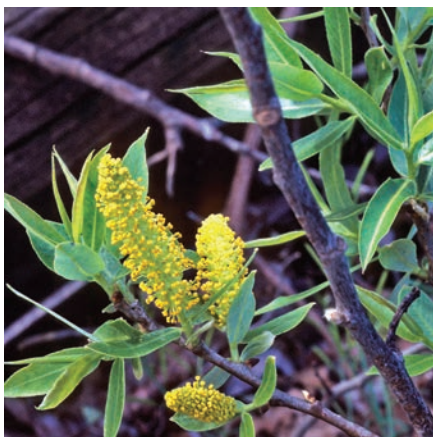
Goodding's Black Willow

Published 2014 by the Redbud Chapter of the California Native Plant Society and CNPS Press