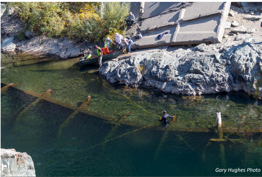
Dive team performs underwater video survey of debris field using tethered system.