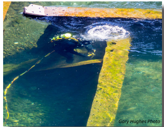
Advanced Marine diver measures metal debris in river.

survey was completed in October 2020, and a removal plan is being developed for submission to Caltrans for action. PARC's goal is for the metal debris to be removed from the river channel in October 2021. There are many steps remaining to meet that timeline, but unless we have a goal to pursue, it is too easy to continue to put off the removal. As for the concrete roadway slabs, they are a bigger project that can be addressed later.