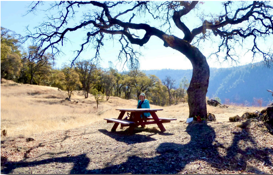
White Oak Flat is a favorite rest area for people from all user groups.

Replacement picnic tables are planned for the China Bar Area in 2021. Thank you members for making these donations possible.