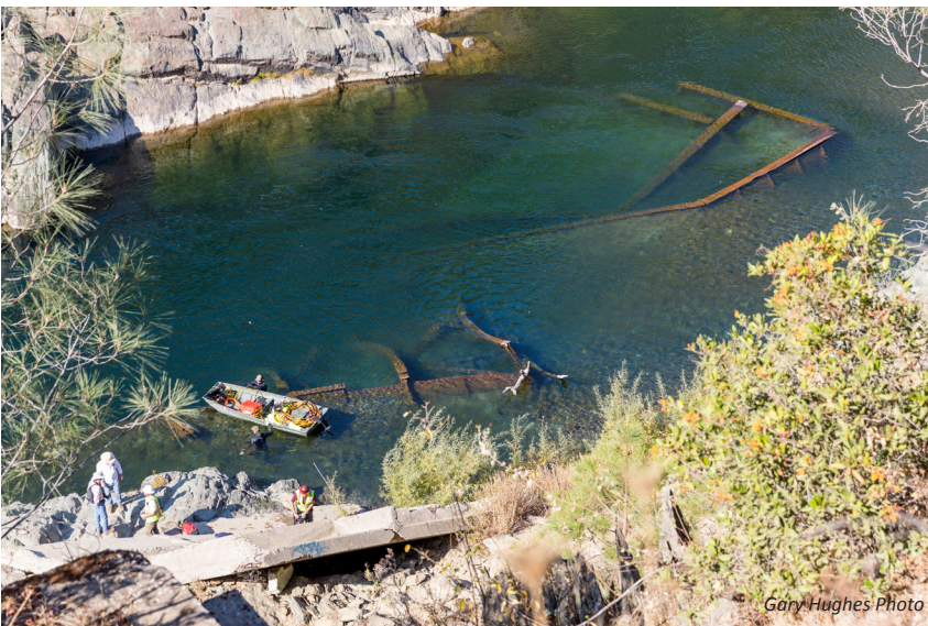
Dive team repositioning video equipment for another dive location