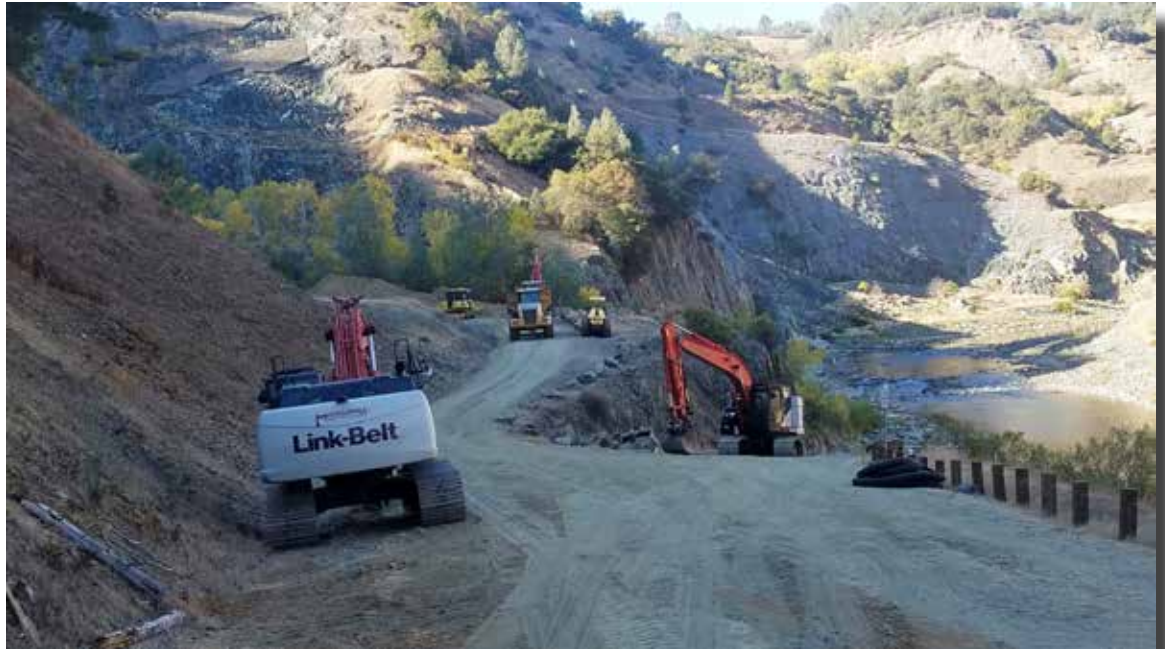
Birdsall River Access below Auburn was damaged in the by high river flows in the winter of 2017. Repairs are now underway and are slated to be complete by the spring of 2020.

Repairs are underway for the Birdsall River Access in the China Bar Area of the Auburn SRA. High river flows, peaking upwards of 40,000 cubic feet per second (cfs), washed out this popular river access in winter 2017. Normal flows are a few thousand cfs. The Bureau of Reclamation and California State