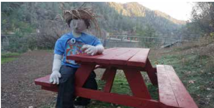
Phillippe (PARC's mascot) awaits your company at the new PARC picnic table by super popular North Fork Dam-Lake Clementine scenic view spot.

By the time you receive this newsletter PARC will have donated and placed 5 new picnic tables in the Auburn SRA for your convenience and enjoyment in 2018. The best part of a hike is to drop your backpack and share food and conversation with hiking partners!