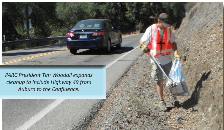
PARC President Tim Woodall expands cleanup to include Highway 49 from Auburn to the Confluence.