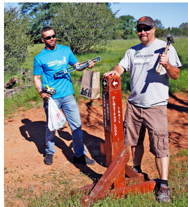
Earth Day volunteers place trail signs in the Knickerbocker area (left) and install new trail map panel at Mammoth Bar (below.) Thanks volunteers!